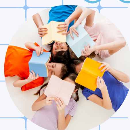
THE BOOK CLUB