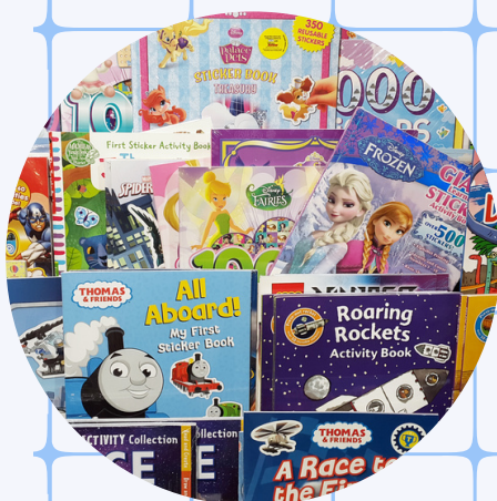
THE BOOK COLLECTION

After exploring the theme of gender equality, we came up with this fantastic idea to start a book club for the kids at our school, focusing on celebrating heroes of all genders who've made significant impacts on the world. Books have this incredible power to broaden our horizons, don't they? So, we curated a selection of stories about remarkable individuals, from trailblazing women in science to men breaking stereotypes in caregiving roles, illustrating that courage and innovation aren't limited by gender. We aimed to make the experience as interactive as possible, knowing that stories can ignite young minds. We organized group readings, facilitated discussions about the characters' life-changing decisions, and even had the kids role-play some of their most defining moments. Watching the children light up with curiosity and enthusiasm, asking insightful questions, and envisioning their paths to making a difference was truly inspiring.