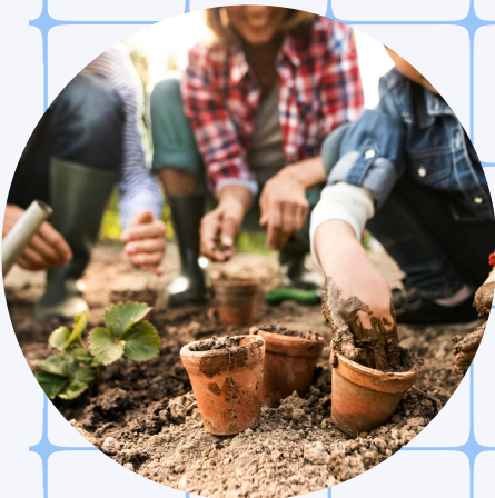
FINDING THE TEAM TO HELP

This project, aligning with the No Poverty goal, received local media coverage, boosting community involvement. We also documented our journey on a blog, highlighting how our efforts contributed to addressing poverty in our area. This hands-on experience taught us the importance of sustainable agriculture and community engagement in fighting poverty.