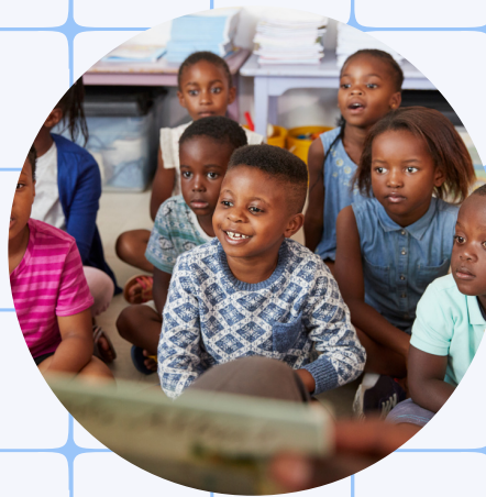
INSPIRING YOUNGER CHILDREN