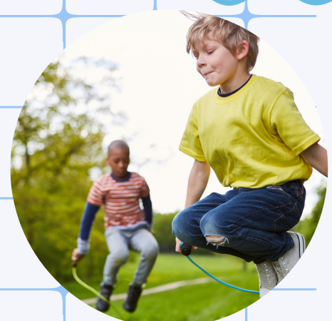
THE CLUB HAD 100 MEMBERS