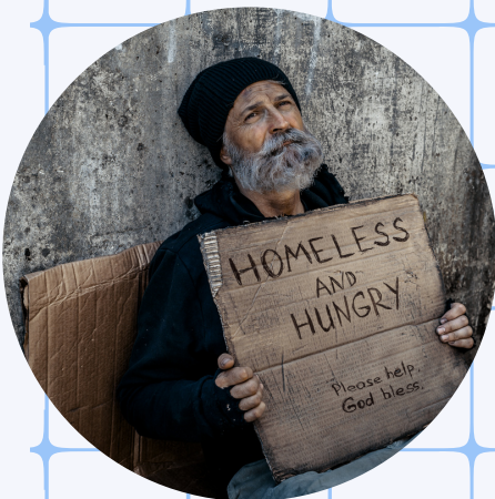
FINDING THE SHELTER

After exploring Sustainable Development Goal 2 - Zero Hunger, I volunteered at a local homeless shelter. This experience allowed me to directly contribute to combating hunger in my community. I prepared and served meals, interacted with the residents, and learned about the challenges they face daily. This involvement was a practical application of the Zero Hunger goal. It provided me with a deeper understanding of food insecurity and its impact on individuals. I shared my experiences through social media and a blog, raising awareness about hunger in our community. This initiative also strengthened my commitment to volunteer work and highlighted the significance of personal involvement in addressing global issues like hunger.