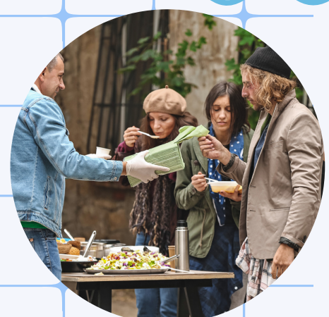
FEEDING THE HOMELESS