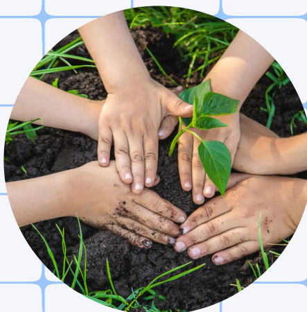
PLANTING THE SAPPLINGS