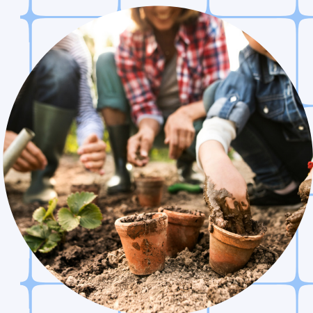
FINDING THE TEAM TO HELP

This project, aligning with the No Poverty goal, received local media coverage, boosting community involvement. We also documented our journey on a blog, highlighting how our efforts contributed to addressing poverty in our area. This hands-on experience taught us the importance of sustainable agriculture and community engagement in fighting poverty.