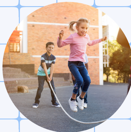
PRACTICING THE ART OF SKIPPING