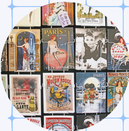
MAKING POSTERS FOR THE CLUB

After learning about Sustainable Development Goal 3 - Good Health and Well-being, I started a skipping club at my school to help everyone get healthy and fit. I set up fun skipping games and taught my friends why exercising is good for us. Doing this club was a cool way to really get into SDG 3. It taught me and my friends how important it is to be active and healthy. I even talked about our skipping adventures on social media and our school blog, so more people could learn about staying healthy. Starting this club showed me how much fun it can be to help others be healthy. It was a great way to do something that helps everyone and learn more about health at the same time.