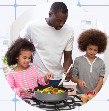
COOKING AT HOME WITH DAD