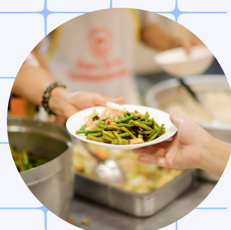
FEEDING THE HOMELESS