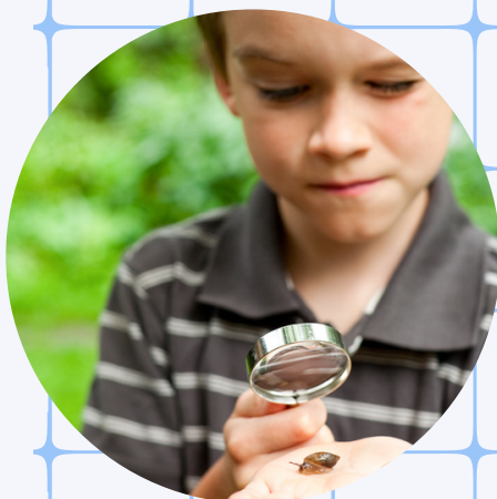
FINDING THE SNAIL

I made it super interactive because I know little kids like to touch and see things rather than just listen. We had drawings, snail races (they're slow, but it was funny!), and we even made snail crafts. It was awesome to see how excited the kids got, and they asked so many questions!