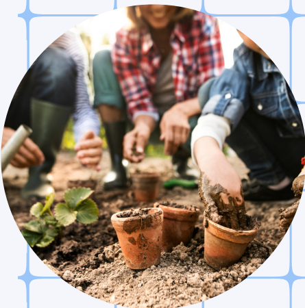
FINDING THE TEAM TO HELP

This project, aligning with the No Poverty goal, received local media coverage, boosting community involvement. We also documented our journey on a blog, highlighting how our efforts contributed to addressing poverty in our area. This hands-on experience taught us the importance of sustainable agriculture and community engagement in fighting poverty.