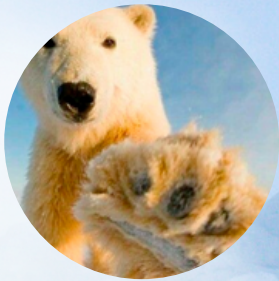
Sharp Strong Claws